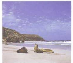
Top Adelaide Convention Centre, Adelaide. Left to right Victoria Square, Adelaide; Shaw & Smith Wines, Adelaide Hills; Seal Bay, Kangaroo Island.

So treat yourself to a holiday round the conference. Make some time before or after to discover the secrets of South Australia. Even with a free day during the program, you've time to visit Kangaroo Island, the Barossa, the Murray River, even the Outback.